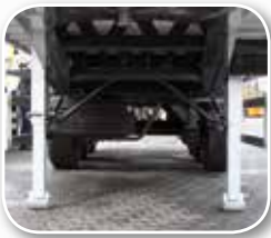
ALUMINIUM SUPPORT LEGS WITH LOCKPIN

In thickness and by additional cross bearers