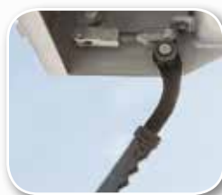
DOOR OPENING FROM THE SIDE