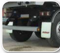
ALUMINIUM BUMPER INTEGRATED TOWING HOOK