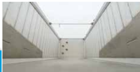
Modular reinforced body with smooth side walls