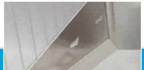
Tapered doubling of the side walls 45° bottom corner reinforcements