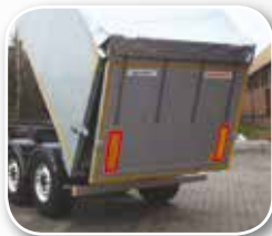
TOP HINGED REAR GATE