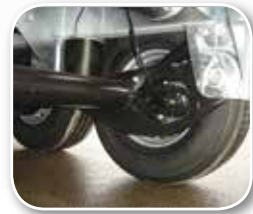
REINFORCED AXLES AND PROTECTED BRAKES