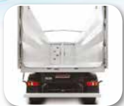
MONOBLOC SIDE WALLS