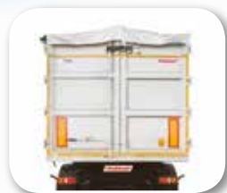
BARN TYPE REAR DOORS