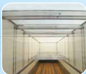
2 ND LOAD LEVEL