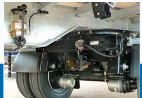
Automatic or manual centralised grease system*