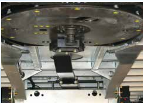
King-pin plate under turntable with steering push-rod