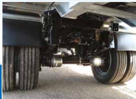
Steering rear axle of 12 tons capacity