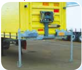
NOSE DIVING SUPPORTS