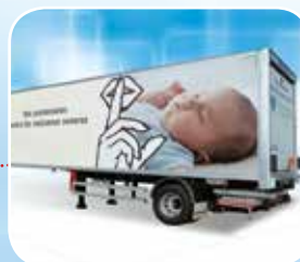
PIEK NOISE REDUCTION