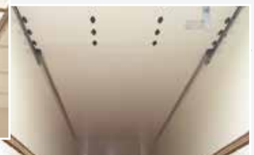
Smooth in plywood or insulated