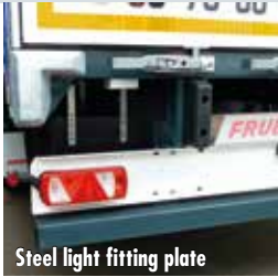
Steel light fitting plate