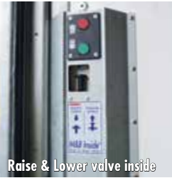
Raise & Lower valve inside