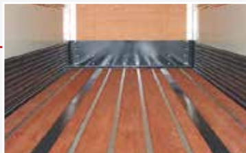
Reinforced scuff liner side wall protection

FROM SCUFF LINERS FOR HEAVY DUTY USE TILL DOUBLE DECK