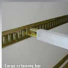
Cargo retaining bar