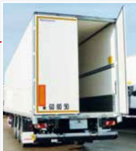
Smooth barn doors