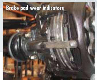
Brake pad wear indicators