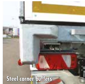
Steel corner buffers