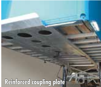
Reinforced coupling plate