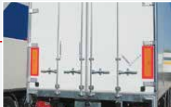
Reinforced barn doors