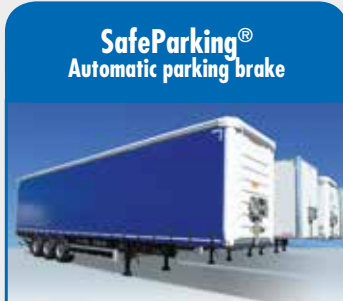
Automatic activation of the parking brake