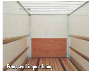
Front wall impact lining