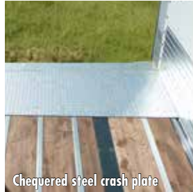
Chequered steel crash plate