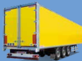
FULL TRAILER LOADS