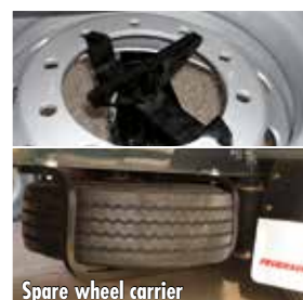
Spare wheel carrier