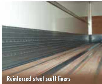
Reinforced steel scuff liners