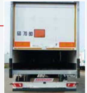
Reinforced frame and roller shutter door