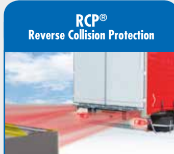
Protection against reversing accidents