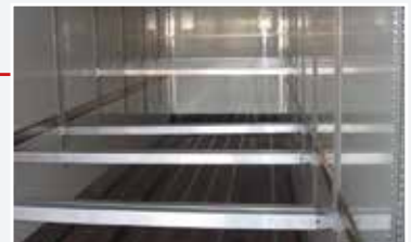
Double deck installation