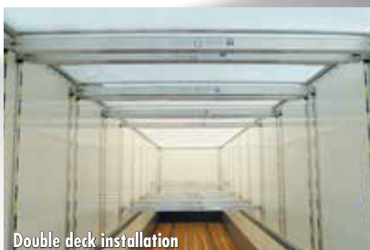
Double deck installation