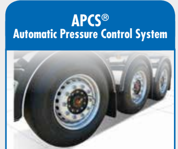
Tyre pressure automatically maintained