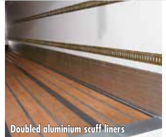
Doubled aluminium scuff liners