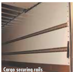
Cargo securing rails