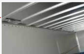
Pre tensioned aluminium roof sheet