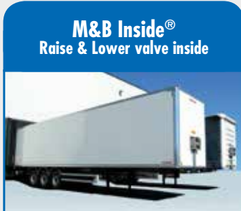
Adjustment to dock level inside the trailer