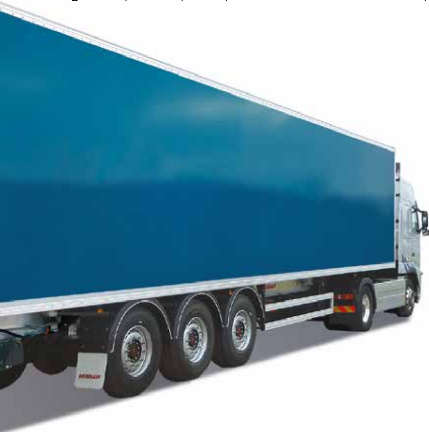
Roof assembly insuring impact resistance and perfect water tightness

Since always, FRUEHAUF designs and manufactures vehicles of which the robustness is highly appreciated in the market. Our fully welded chassis frames, our sturdy floors and our strong body design are perfectly adapted to intensive and heavy duty use.