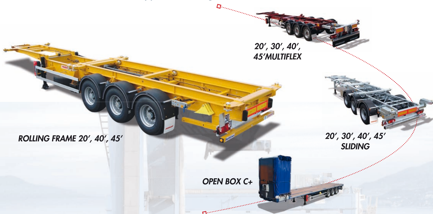
ROLLING FRAME 20', 40', 45'

Numerous different container types on a single chassis