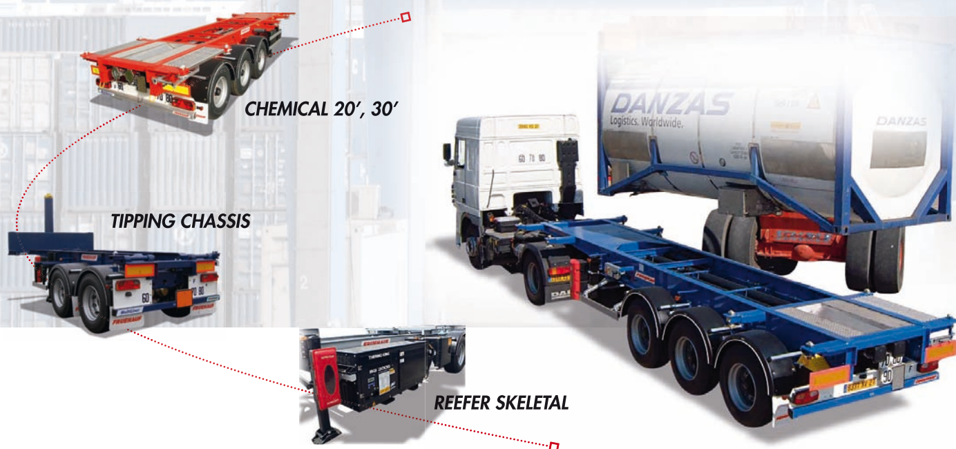
CHEMICAL 20', 30'

Specialised container operations, Reefers, Tanks, Chemical, Bulk