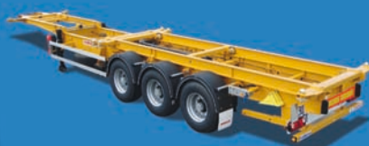
The MULTI PURPOSE